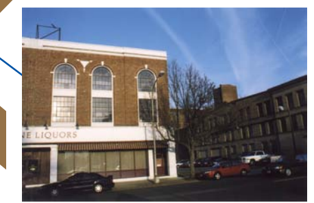
13. U.S. HOTEL/BATES TAVERN/WARRINERS TAVERN Main St. across from Howard St.