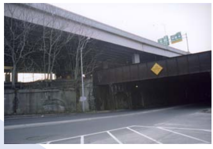
Old Railroad Bridge