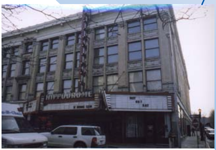
2. MASSASOIT HOUSE Main St. and Gridiron St.