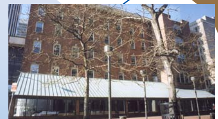
7. PYNCHON STREET METHODIST CHURCH